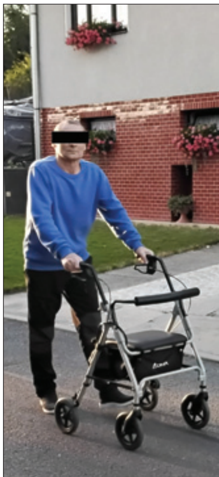
Fig. 3. Our patient three months after CAR T-cell therapy (with his permission).

thrombocytopenia, and severe neutropenia), meeting the criteria for grade III late immune effector cell-associated haematologic toxicity [15,16]. A follow-up PET/CT scan, lumbar puncture, and bone marrow biopsy three months after CAR T-cell therapy showed no evidence of MCL, although the patient remained severely pancytopenic, with an improved neurological status (Fig. 3). Written informed consent for the publication of the clinical details and images in this case report was obtained from the patient.