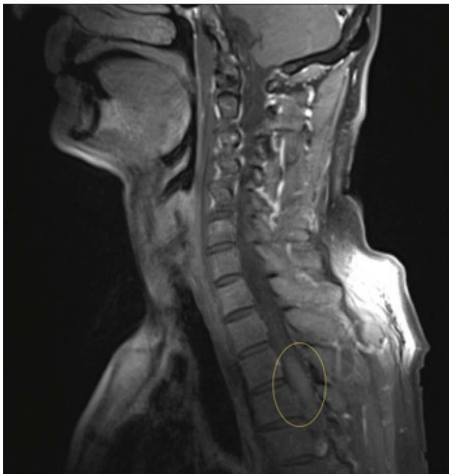
Fig. 1. Thoracic lesion on an MRI scan in November 2024.

Due to persistence of CSF involvement by MCL cells after one cycle of MATRIX regimen and one month of ibrutinib therapy with another four intrathecal applications, the patient was referred for CAR T-cell therapy with brexucabtagene autoleucel. Mononuclear cell collection was performed in March 2025. The dynamics of CSF involvement by pathological lymphocytes are shown in Fig. 2. Following lymphodepletion with fludarabine and cyclophosphamide, CAR T-cell therapy was administered in April 2025. The patient's hospital stay was complicated by grade I cytokine release syndrome, as defined by the American Society for Transplantation and Cellular Therapy, as well as by prolonged pancytopenia (moderate anemia, severe