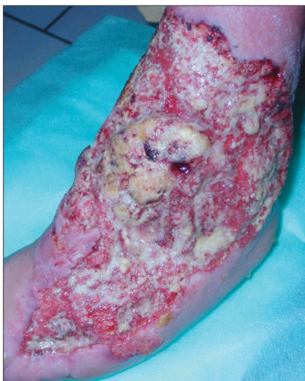
Fig. 1. A large ulceration on the left lower leg and foot with a slightly elevated edge and the malignant proliferation in the central area of the lesion.

On admission a huge ulceration on the left lower leg and foot was noted (Fig. 1). The edge of the ulceration was slightly elevated and in the central area of the lesion proliferation of the tissue was seen (Fig. 1). The surrounding skin showed slight erythema and maceration of epidermis. The peripheral lymph nodes were not enlarged. Additionally, a small nodule (about 0,5 cm in diameter) with a dilated vessels on the surface was stated on the right lower lid.