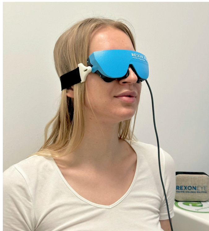
Figure 2. Application of Rexon-Eye therapy, the patient is wearing a specialized mask connected to the device

A total of 30 patients were included in the study: 20 women (mean age 64.9 years) and 10 men (mean age