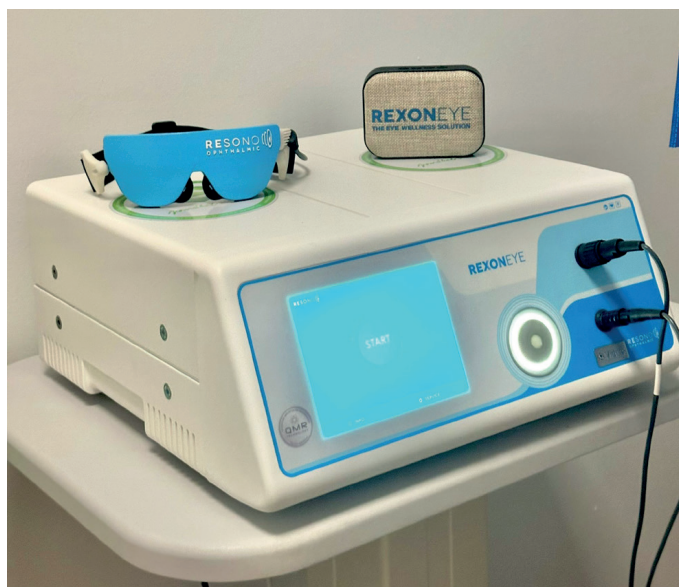
Figure 1. The Rexon-Eye device using Quantum Molecular Resonance (QMR) technology for non-invasive therapy of dry eye syndrome

Active eye infection or inflammation, allergic conjunctivitis, recent eye operation (less than 3 months), wearing