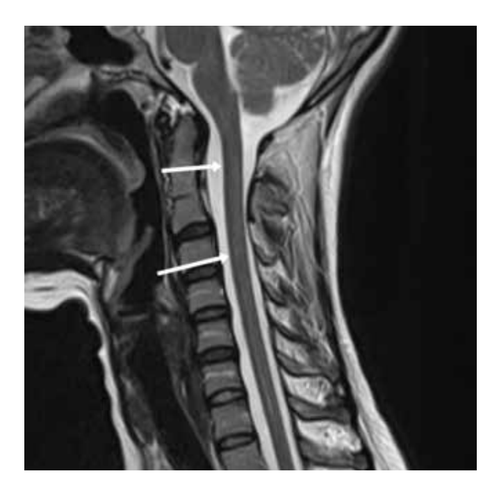
Figure 1. Weak hyperintense appearance in the form of plaques in T2-weighted series at the level of C2–C4 vertebrae in the cervical spinal cord

Foetal development was frequently monitored, and obstetric ultrasounds were all normal. Double and triple