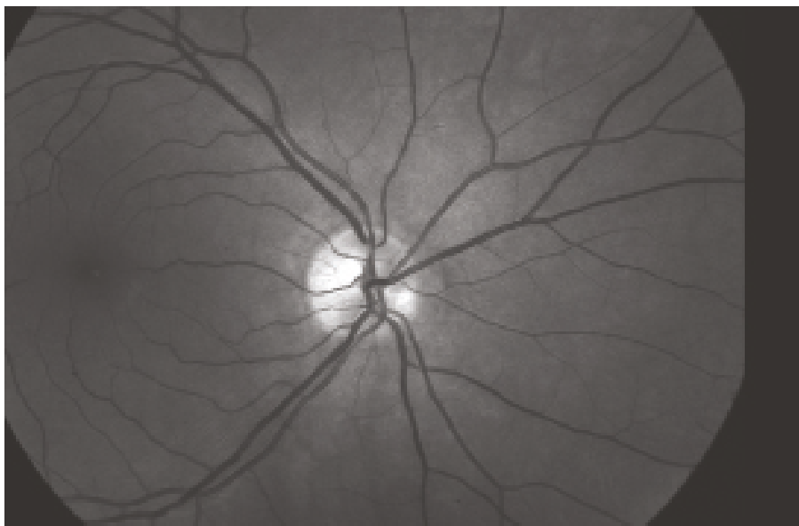
Fig. 3. Photograph of ocular fundus at wavelength of 570 nm (same area as on Fig. 2 and 4).