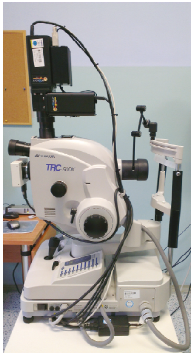
Fig. 1. Retinal oximeter Oxymap T1 (black instrument above) placed on Topcon retinal camera

non-invasive automatic retinal oximeter, a watershed was reached in research into retinal oxygen parameters. The dual non-invasive retinal oximeter Oxymap T1 (Oxymap ehf., Reykjavik, Iceland) is composed of two digital cameras, a special optical adapter, an image divider and two narrow band filters. The entire device is attached to a standard retinal camera (TRC-50 DX, Topcon corp., Tokyo, Japan), which is used to obtain two images of the retina with different wavelengths in a single moment (Fig. 1) [23,24,25]. Light absorbance of the blood vessels is influenced by the absorbance (colour) of the blood in the vessel, which is determined by the presence of oxygenated or non-oxygenated haemoglobin A. Light absorbance of oxygenated and non-oxygenated haemoglobin A differs in several wavelengths, but in some it is the same. These wavelengths are referred to as isosbestic, and one of these is the wavelength of 570 nm. Among others, the wavelength of 600 nm (Graph 1) is non-isosbestic. In comparison with the fluctuating colour