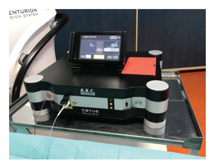
Fig. 1. Nanolaser Cetus ARC Laser GmbH, Erlangen, Germany

Excluded from the cohort were patients with a pathologically altered anterior segment of the eye, such as corneal opacities, keratoconus, symptoms of uveitis, pseudoexfoliation syndrome, zonular dialysis, glaucoma and diabetes.