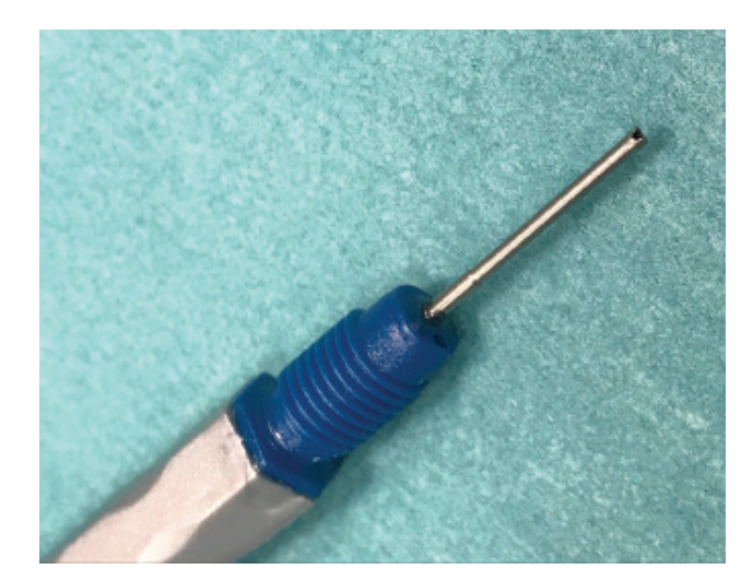
Fig. 2. Detail of end of nanosecond laser

0.98 \pm 0.04 . There was no statistically significant difference between the individual groups (p = 0.65).