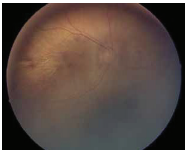
Fig. 5: Ocular fundus in patient with Marshall/Stickler syndrome, left eye. For description see table no. 2.