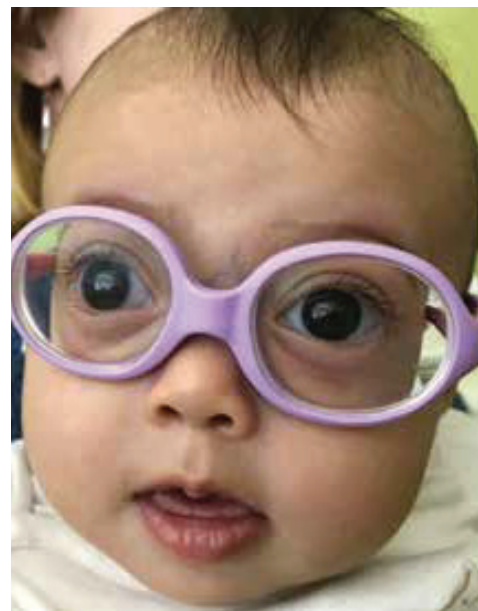
Fig. 6: Central facial dysmorphism, shallow orbits, pseudo-exophthalmos, hypertelorism and low root of nose in patient with Marshall/Stickler syndrome at age of 15 months.