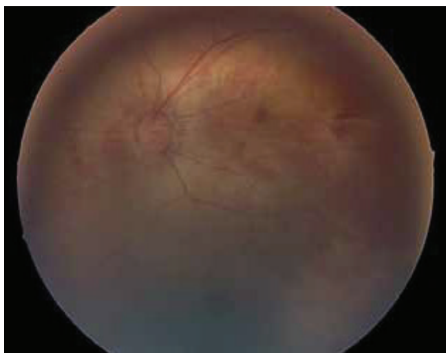
Fig. 4: Ocular fundus in patient with Marshall/Stickler syndrome, right eye. For description see table no. 2.