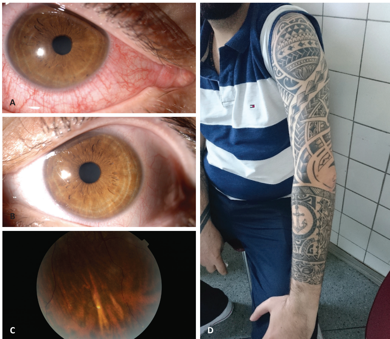
Fig. 2 – Patient no. 2

2a Tattoo of left arm without induration or redness of skin