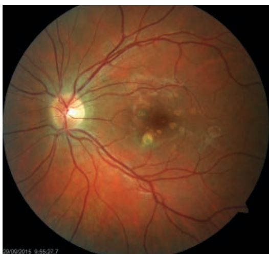
Fig. 5 Left eye. Original active deposit on retina progressively bordering and partially pigmented