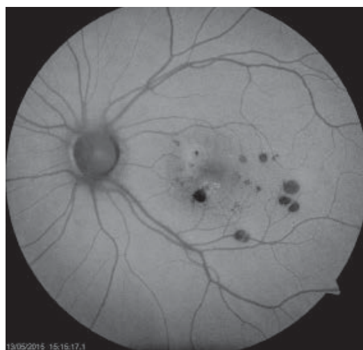
Fig. 6 Auto-fluorescence photograph of ocular fundus of left eye. Deposit of atrophy of RPE