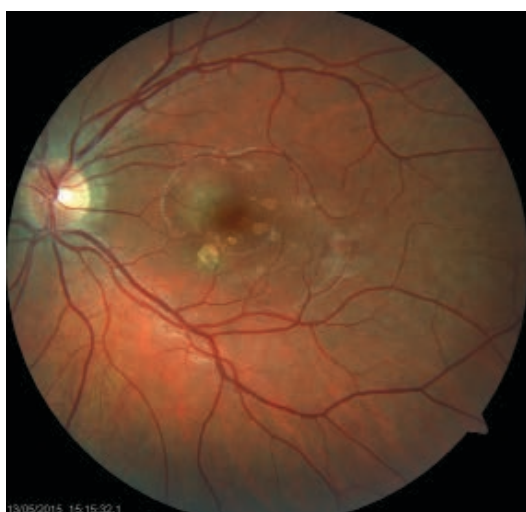
Fig. 1 Left eye. Finding of acute inflammatory deposit in central region of retina