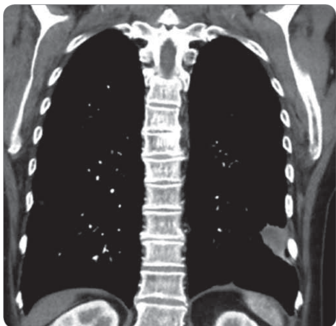
Fig. 3. Control CT of lung and mediastinum – progression of tumor (6/2014).