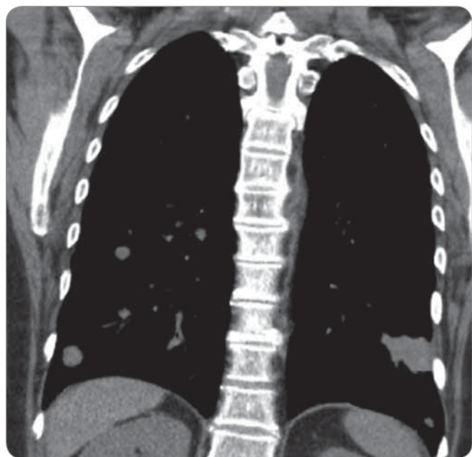
Fig. 1. Input CT of lung and mediastinum (8/2013).

Rare mutations are described in the literature, approximately in 10%