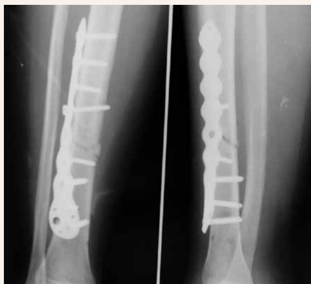
Fig. 3 | X-ray image of the injured limb after 1.5 months after the third injection. Signs of the formation of a bridge of the periosteal callus