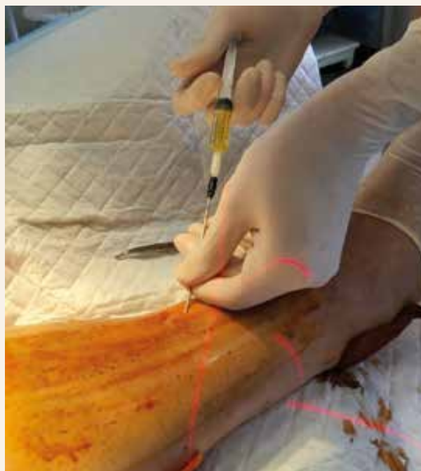
Fig. 2 | Performing the PRP injection procedure into the fracture space