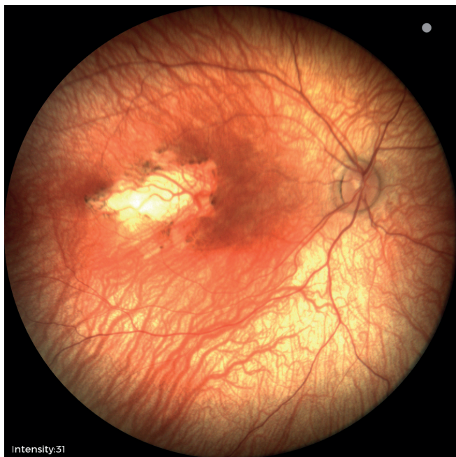
Figure 3. Partially pigmented scar in the central region of the right eye