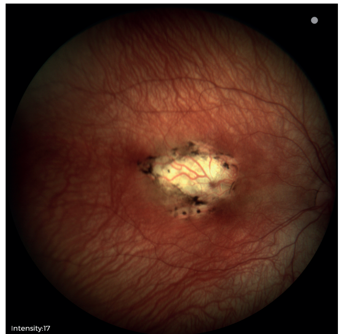
Figure 4. Pigmented retinal scar in the right eye after several reactivations and parenteral ganciclovir treatment