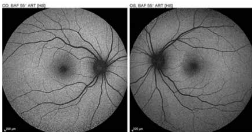
Figure 3. Autofluorescence (AF) of both eyes have normal appearance