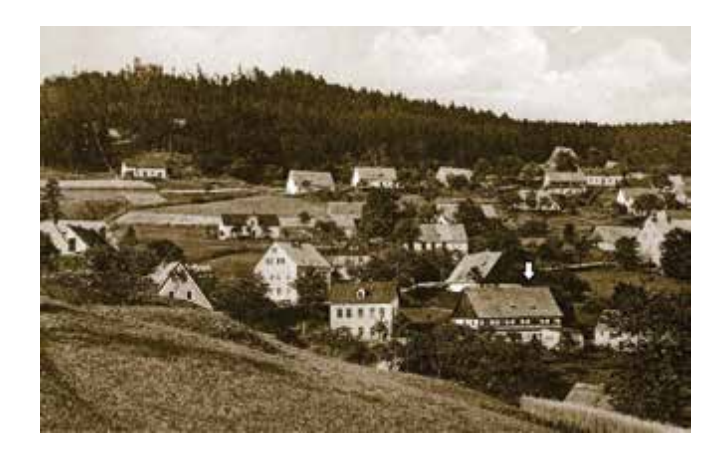
Figure 2. Birthplace of Ferdinand von Arlt in Obergraupen (Horní Krupka), early 20th century (arrow)

by Prince Johann von Clary und Aldringen (1753–1826) [1]. The school was in the centre of the village next to St. Valentine's Church. Today, on that site at the address Vrchoslavská 2/3, is a three-story residential building. He attended grammar school from 1825 in Leitmeritz (today Litoměřice) in Jesuitengasse, which was located next to the Episcopal Priestly Seminary (former Jesuit residence). In Litoměřice he had accommodation at the grammar school (alumnat) [2]. Today this is Jesuit Street no. 18 and 20, and the former seminary was at no. 22.