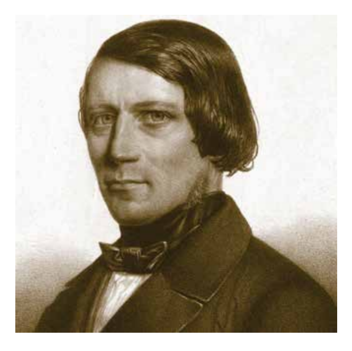
Figure 1. Ferdinand von Arlt (1812–1887) at the age of about 40 (Lithograph by Moritz Golde, printed in the studio of Franz Hanfstaengl in Dresden)