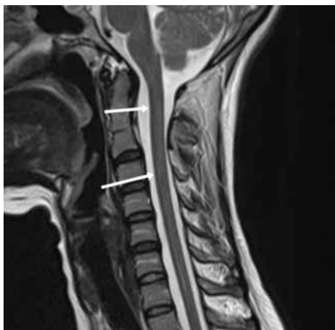
Figure 1. Weak hyperintense appearance in the form of plaques in T2-weighted series at the level of C2–C4 vertebrae in the cervical spinal cord

As gestation reached 39 weeks, the patient was hospitalised because of regular uterine contractions. Although a normal vaginal delivery was planned, an emergency Caesarean section was performed under general anaesthesia because of cephalopelvic disproportion (CPD). No complications occurred during the delivery and postpartum period.