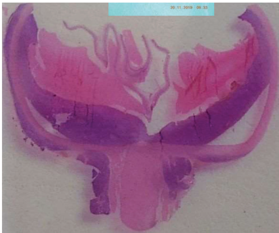
Figure 3. Histological finding: the tumour on the posterior wall of the bulbus under the choroidea and a retrobulbar infiltration around the optic nerve

enucleation, the haematologist-oncologist indicated a positron emission tomography examination with computed tomography, which was negative for lymphoma disease. Ophthalmological examinations are performed at half-yearly intervals, with simultaneous monitoring of the right eye for possible development of bilateral lymphoma. The right eye remains without signs of lymphoma. Intraocular localisation of lymphoma with retrobulbar infiltration around the optic nerve remains the only detected localisation of primary intraocular lymphoma. Enucleation was used as a diagnostic as well as a treatment modality.