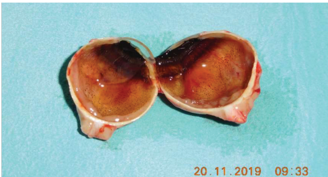
Figure 2. Bulbus after the enucleation: intrabulbar mass 2x1cm with circular overgrowing around the optic nerve

wall of the bulbus under the choroid was described as a solid infiltration of small lymphocytes, with a round or slightly folded nuclear membrane, lumpy chromatin, central nucleus, small amount of cytoplasm, with formation of germ / proliferative centres; mitotic activity was low. The same infiltration was in the retrobulbar tissue around the optic nerve.