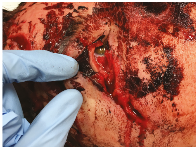
Fig. 3a. Open wound of outer corner, including torn lower canthal ligament. Patient after traffic accident