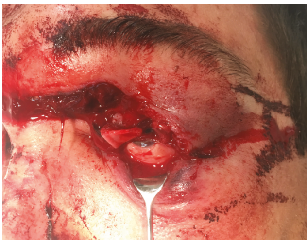
Fig. 5a. Industrial injury by saw. The wound on the upper eyelid is deep enough to cause damage to the musculus levator palpebrae superioris

Minor superficial injuries to the eyelids can be resolved conservatively, with the application of antibiotic cream.