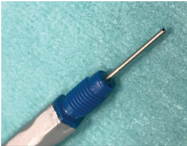
Fig. 2. Detail of end of nanosecond laser

0.98 \pm 0.04 . There was no statistically significant difference between the individual groups ( p = 0.65 ).