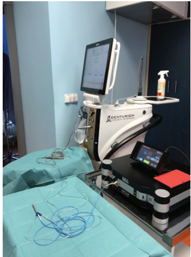
Fig. 3. View of connection of both instruments

After 7 days, both groups had very similar results of improvement of UCVA, which attests to rapid rehabilitation of vision in both techniques. Similar results are also stated in the literary sources (1, 2, 3, 6).