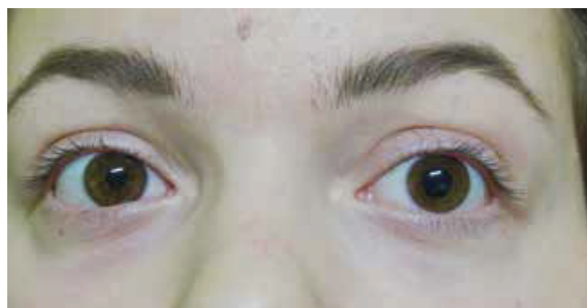
Fig. 4. Anisocoria upon dilation of pupil of left eye in a 16-year-old patient