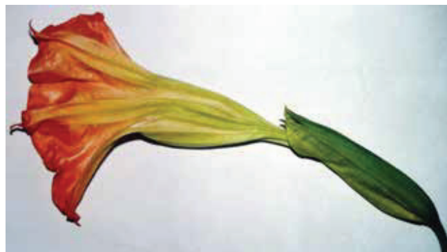
Fig. 2. Goblet-shaped flower of plant Datura suaveolens

in the left eye, there was also no constriction of the pupil. A test with 1.0 Pilocarpine differentiates a neurogenic cause of mydriasis from mydriasis caused by a cholinergic antagonist. If the muscarinic receptors on the affected side are occupied by an anti-cholinergic agent, 1% Pilocarpine leads to weak or no miosis. By contrast, in the case of neurogenic causes of mydriasis, clear constriction of the pupil takes place upon its application (2). In this case therefore the pharmacological test confirmed mydriasis induced by an anti-cholinergic agent. After a number of targeted questions (what was the child doing, where was it playing, with what did she come into contact, for example plants?) we determined contact with the plant Datura suaveolens , known as “Brazil's white angel's trumpet” (Fig. 2). The child broke off and held in her hand a goblet shaped flower of this plant. The medical history of contact with Datura suaveolens , which contains alkaloids such as L-hyoscyamine, atropine and above all scopolamine, therefore corresponded with the objective finding in the child – juice from the flower probably came into contact with only one eye. The child's agitation and reddening of the cheeks could also have been a symptom of mild general intoxication. Spontaneous correction ad integrum took place without therapy within 24 hours (Fig. 3).