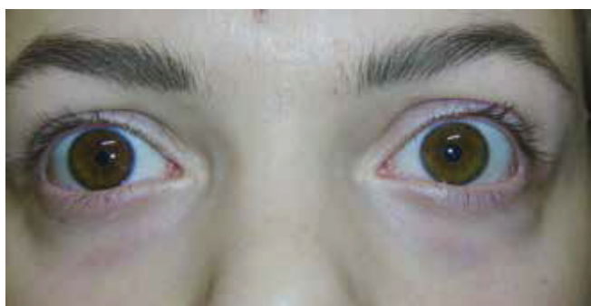
Fig. 7. Positive result of pharmacological test with application of 1.0% Pilocarpine in left eye

pharmacological mydriasis generated by an anti-cholinergic agent (Fig. 7). The objective ocular finding corresponded to neurogenic damage to the parasympathetic part of the left-sided oculomotor nerve, therefore ophthalmoplegia interna comes into consideration. Additional MRI of the brain focusing on the left-sided oculomotor nerve and MRI angiography of the brain capillaries were without evident structural changes. With regard to the negative MRI finding, as well as the fact that spontaneous correction of the width of the left pupil as well as near vision occurred in the patient within less than 24 hours (Fig. 8), we concluded this episode of anisocoria as benign episodic unilateral mydriasis syndrome (BEUM).