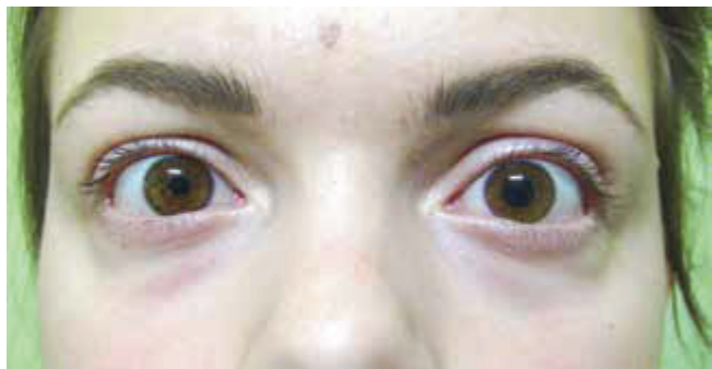
Fig. 6. Negative result of pharmacological test with application of 0.1% Pilocarpine in left eye