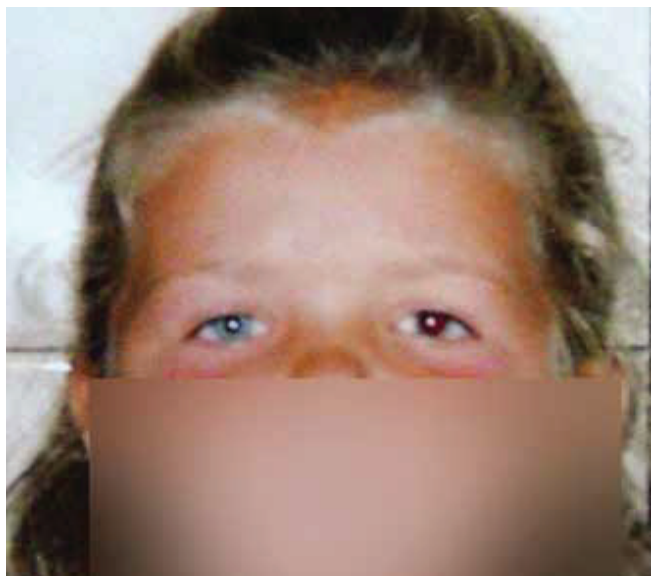
Fig. 1. Anisocoria upon dilation of pupil in left eye in a 6-year-old patient