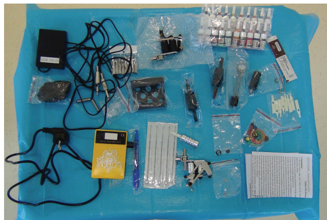
Fig. 1. Tattooing kit and pigments

During a follow-up examination 3 days after the operation, the eyeball was only slightly superficially injected, in