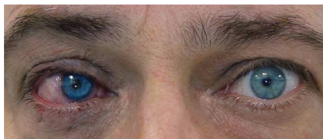
Fig. 6 and 7. Patient no. 3 before and after KTP procedure