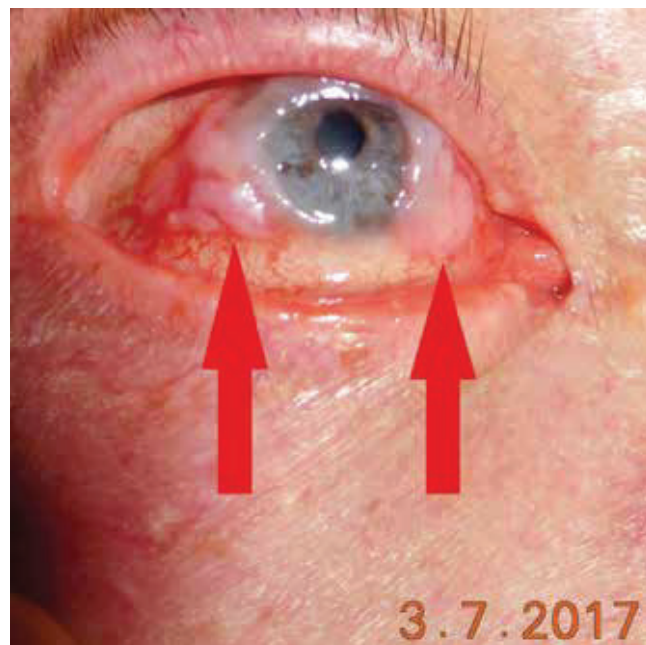
Fig. 6: Clinical picture of a patient with squamous cell carcinoma of bulbar conjunctiva