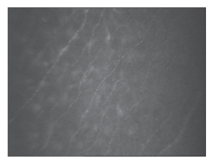
Fig. 1 Nerve fibres of the subbasal nerve plexus in a healthy subject

sensorimotor neuropathy) was manifested in these subjects within 3.5-4 years (36, 63). A longitudinal study conducted by Dehghani et al. was focused on risk factors in subjects with changes of the subbasal nerve plexus without the presence of DN. After four years of observation, the study demonstrated a detriment of fibres of the subbasal nerve plexus in dependency on clinical and metabolic factors such as age, level of glycated haemoglobin and disorder of the lipid metabolism (14). Change of the nerve plexus were also described in children with type 1 DM (66).