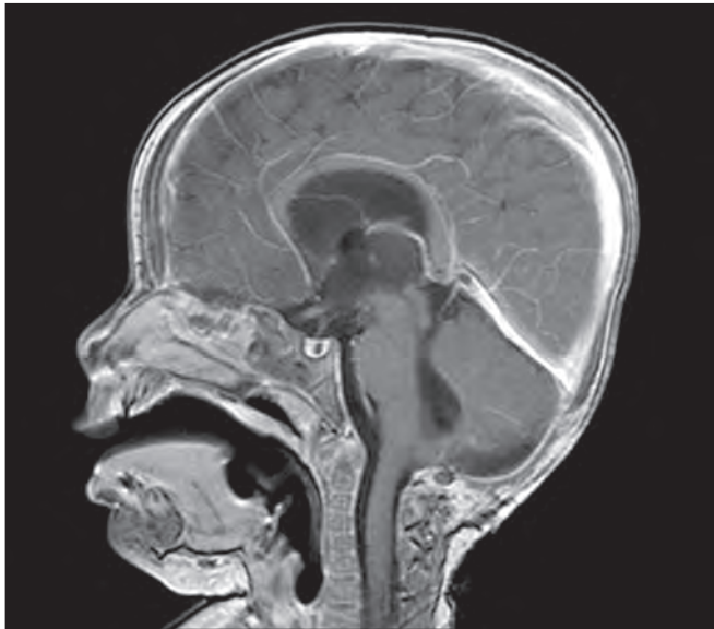
Fig. 3. Postoperative sagittal MRI section.

only congenital but also iatrogenic (e.g. due to lumbar puncture performed with an open needle) or traumatic (e.g. due to a stab or puncture wound), occurring as a consequence of an implantation of skin elements from the surface into underlying tissues. This type of a cyst may occur at any age but much less commonly than the congenital one [6]. At present, CT and MRI scans are both used for the diagnosis of this tumour. CT images the dermoid cyst as a hypodense lesion, not enhancing after a contrast agent administration, unlike abscesses that, if present, are more dense and their capsule is markedly enhanced by a contrast agent. CT bone window is used for bone defects detection. Defects not diagnosed with CT (axial slices may miss it) can be identified with MRI, especially with sagittal plane sections that show the typically oblique stalk that links the cyst with the skin [7]. Dermoid cysts tend to show an increased signal intensity on both T1 and T2-weighted MRI images and a low signal intensity on STIR images [8], although a ruptured cyst may be hypointense on T1-weighted images and hyperintense on T2 [8]. Posterior fossa dermoid cysts may be divided into four types: extradural dermoid cysts with a complete dermal sinus, intradural dermoid cysts without a dermal sinus, intradural dermoid cysts with an incomplete dermal sinus and, as in our case, intradural dermoid cyst with a complete dermal sinus [3]. Intradural dermoid cysts with a complete dermal sinus are difficult