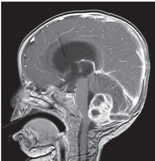
Fig. 1. Sagittal MRI section showing a cerebellar mass lesion communicating subcutaneously through the occipital bone defect.

Dermoid cysts are true ectodermal inclusion lesions lined with epithelium, composed of various amounts of well-differentiated ectodermal and mesodermal elements (endodermal elements are usually not observed, these are more suggestive of a germ cell tumour). Some of these ectodermal inclusions may be hair follicles, sebaceous glands or even sweat glands. The majority of congenital dermoid tumours probably develop during the early stages of development, between the 3 rd to 5 th week of gestation. The presence of another associated congenital anomaly in 50% of patients with dermoid cysts is suggestive of a midline fusion defect. According to the available literature, dermoid cysts are not