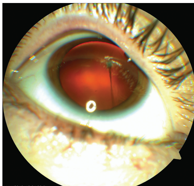
Fig. 3 Colour photographic image of anterior segment of right eye: persistent hyaloid artery binding to posterior part of capsule of intraocular lens