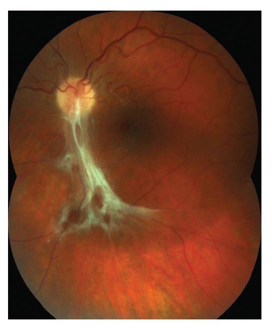
Fig. 5 Colour photographic image of fundus of left eye: preretinal fibrosis in lower temporal arcade causing draping of retina in central landscape

evident laser traces, otherwise the retina was without deposit changes, attached. On the ocular fundus of the LE there was manifest preretinal fibrosis, causing draping of the retina in the central landscape (CL), where a lamellar defect of the neuroretina was also evident, otherwise the finding on the retina was within the norm (fig. 5). In the LE an examination was concurrently performed with the aid of optical coherence tomography, which confirmed a separation of the retinal layers in the lower temporal arcade with epiretinal fibrosis, including a defect of the lamellar layers of the retina (fig. 6).