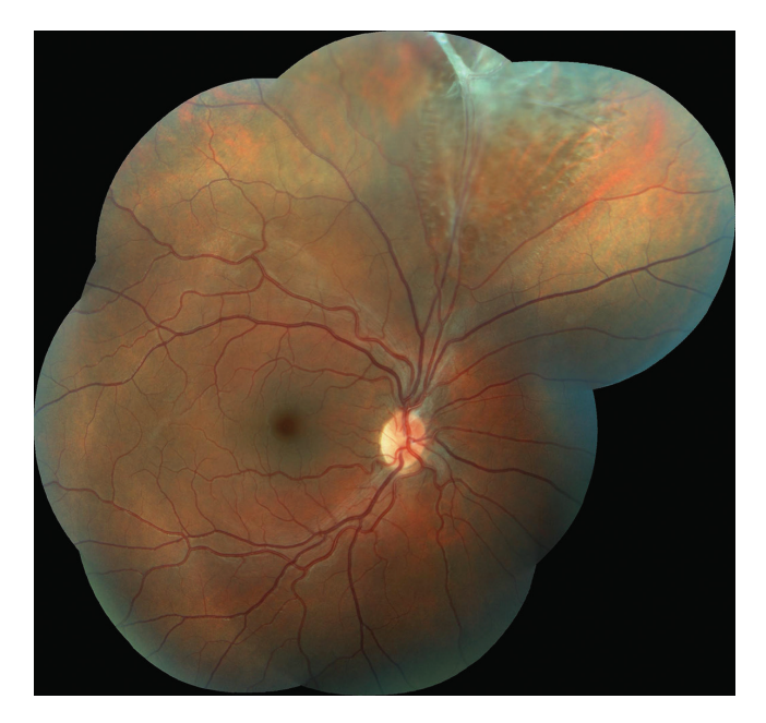
Fig. 1 Colour photographic image of the fundus of the right eye: the retina is thinned in the upper quadrants, in the upper temporal arcade there are residues of persistent hyaloid artery with fibrotic tissue, causing local retinoschisis of an older date.

method was within the norm, in the right eye 17 torr and in the left eye 13 torr. Visual acuity (VA) evaluated with the aid of Snellen's optotypes was as follows: uncorrected visual acuity (UVA) in right eye 0.4, with correction -0.5cyl on an axis of 40° 0.8, in left eye UVA 0.8, not improved by correction. Upon examination on a slit lamp, the finding on the anterior segment was bilaterally physiological.