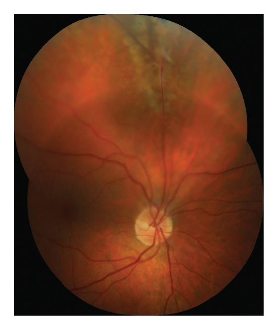
Fig. 4 Colour photographic image of fundus of right eye: proximal segment of persistent hyaloid artery binding to upper temporal arcade, with local tractional retinal detachment of an older date

posterior capsule of the lens (fig. 3), also physiological finding on the RE as well as LE. Fundoscopy in mydriasis of the RE demonstrated a proximal part of the PHA adhering to the upper temporal arcade, where it conditioned the origin of local TRD of an older date (fig. 4), in the surrounding area there were