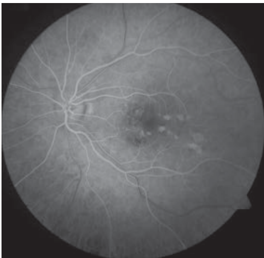
Fig. 3 FAG of left eye. Hyperfluorescence of window defects of RPE in place of inactive inflammatory lesions